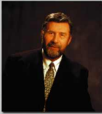
Eyðun Elttor Minister of Petroleum and the Environment